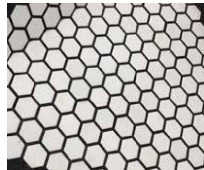
Grouting for alumina tiles